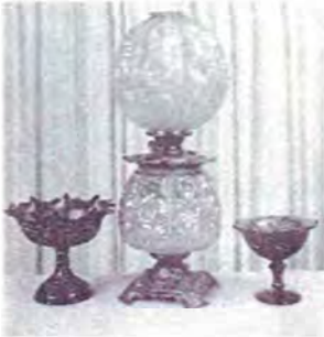
Open Compote Grape & Cable Purple $375.00