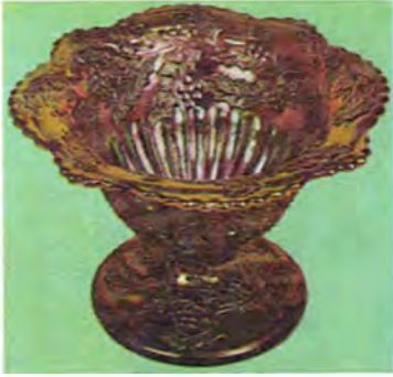
Christmas Compote Purple $3,000.00