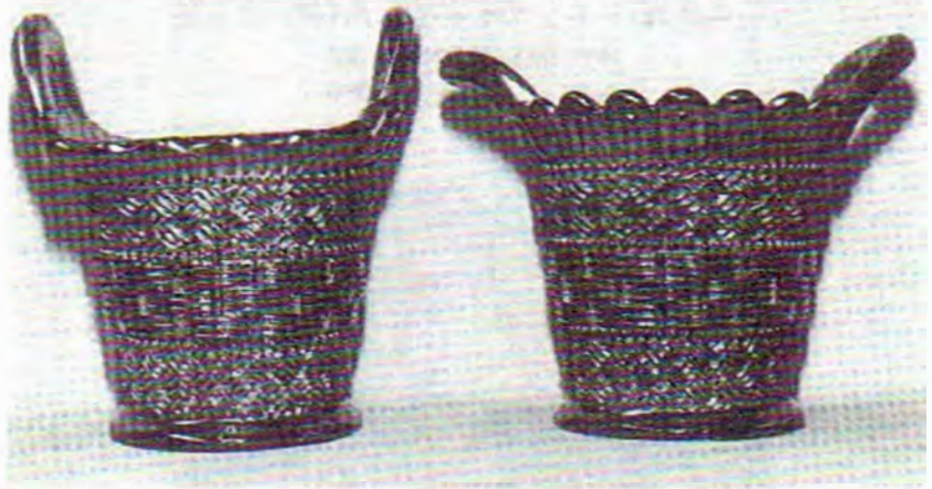
Permission granted for this series by Bob Grissom. Heart of America Carnival Glass Ass. Educational Series I - Copyright 1990 Color Photograph courtesy of Dave Doty