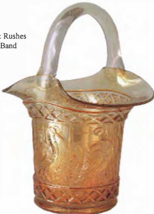
Stork & Rushes Lattice Band Basket

Butler Brothers show these appearing in the April 1915 three March 1922. Of course, the ones we all have, we would like to think were made in 1915. Most are not the greatest color after being made into a whimsey. The tumblers, however, have pretty good color most of the time.