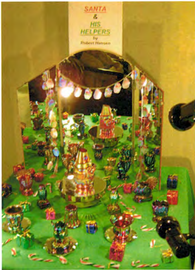
Air Capital Room Display Winner – Gale Eichhorst