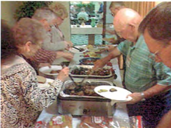
Air Capital Convention Thursday Night Barbeque