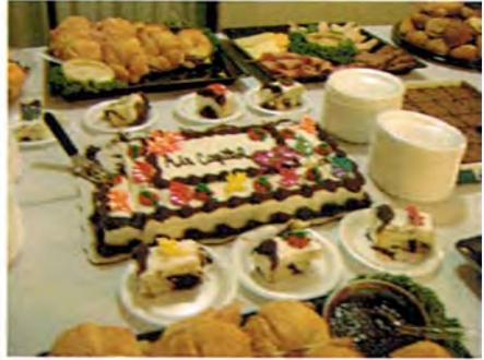
Just Hanging Out